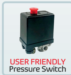
USER FRIENDLY Pressure Switch