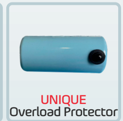
UNIQUE Overload Protector