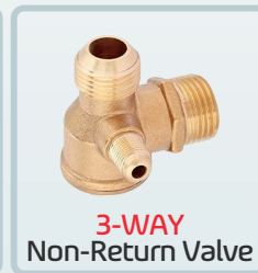
3-WAY Non-Return Valve