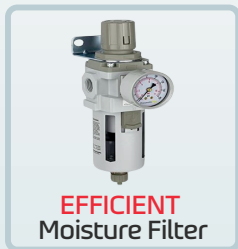
EFFICIENT Moisture Filter