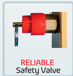
RELIABLE Safety Valve