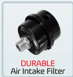
DURABLE Air Intake Filter