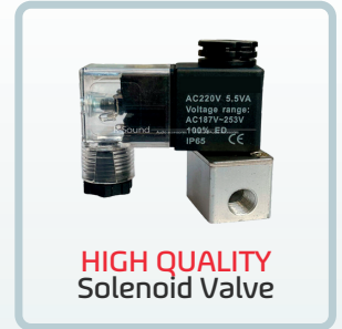
HIGH QUALITY Solenoid Valve